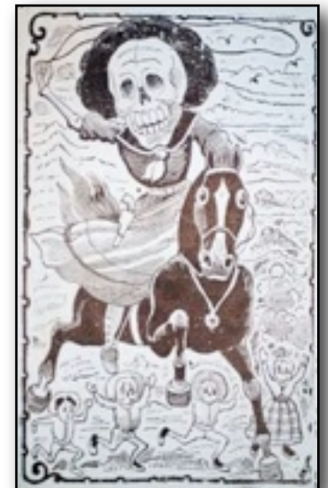
La Maderista by José Guadalupe Posada.

Find further information on the SFS Día de los Muertos, as well as the SFS full December Concert Programme on www.sfsymphony.org