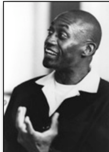
Portrait SW Ismael Ivo